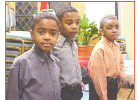
Future PBC Leaders