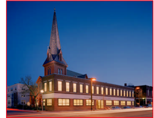
Peoples Baptist Church of Boston A Christ Centered and Caring Church